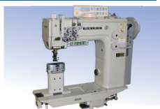
POST BED MACHINE