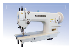
FLAT BED MACHINE