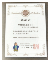
Funabashi-Specialty Brand Certificate

vertises them with motion pictures in the city hall and in the promotion activities carried out by "Funabashi-Specialty Brand Conference" (at Citizen Festival, Funabashi Morning Market, Department stores and others).