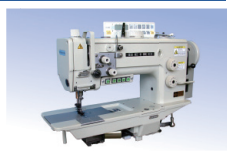
FLAT BED MACHINE