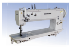
LONG & HIGH ARM MACHINE