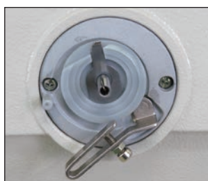
Built-in bobbin winder