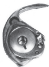
Long beak oscillating shuttle hook