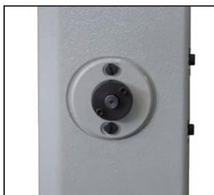
Idler for belt tension adjustment