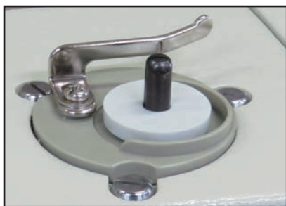
Built-in bobbin winder